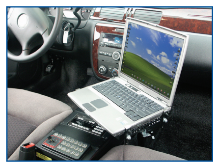
Laptop Computer Mount Simple & economical computer mounting system to install. Ideal for limited space applications. Uses existing seat bolts to mount. Telescopes to desired height.